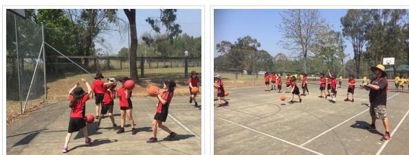
Children enjoying a great day at Kurrajong East Public School

On Friday 1st November a number of students from Stage 2 competed against some local schools in the Super Sports Cup Gala Day held at Kurrajong East PS. It was a hot day for the kids but with some games involving water they cooled off and had a blast. They played a variety of games including soccer, basketball, volleyball with a water balloon, tug of war, dodgeball and a few more. On the day they finished upcoming 3rd out of 5 schools and had a great time doing it!!