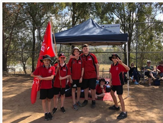
Students ready for a great Bootcamp Gala Day