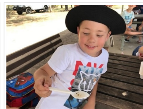
Our children enjoying the day at Penrith Lakes Environmental Centre