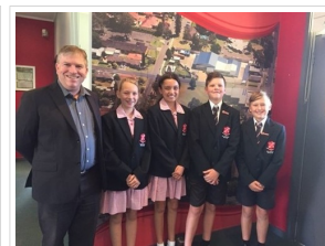
Our School Leaders