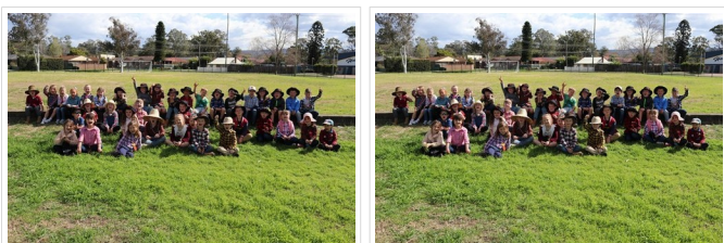
Kindergarten had a fun-tastic farm filled day!!

On Wednesday the 19th of August, Week 5, Kindergarten had a fun-tastic farm filled day!! KM kicked it off with visiting the Golden Ridge Farm incursion first followed by KR. Both classes showed off the learning they have been engaging in their classes by answering lots of questions! The students loved holding rabbits, ducklings and chicks! They got to pat, brush, feed and give bottles of milk to the lambs and goat kids. Some of the little babies were so hungry, they kept nibbling on our Kindy's shirts! The classes enjoyed recess together and played farm themed games on the oval afterwards. A very memorable day to remember indeed!