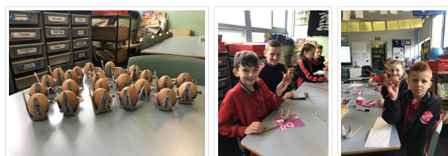
Our Eggcellent Penguin Parents!!

However, out of 24 eggs only 7 eggs died. I think we did pretty well.